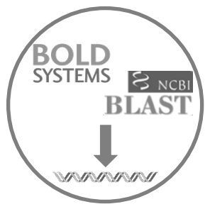
Download all sequence data available for the genus