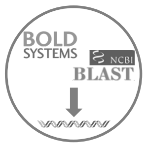
Download all sequence data available for the genus