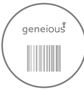
Filtering the data and selecting 'promising' markers