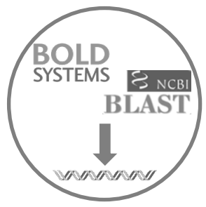
Download all sequence data available for the genus