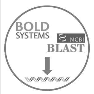
Download all sequence data available for the genus