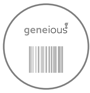
Filtering the data and selecting 'promising' markers