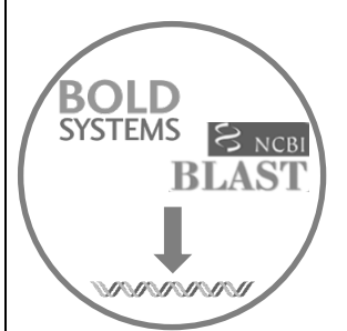
Download all sequence data available for the genus